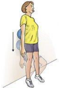
Wall squat with a ball