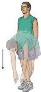
Iliotibial band stretch (standing)