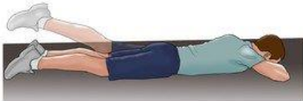
Prone hip extension