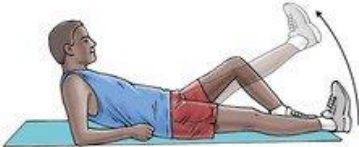
Straight leg raise